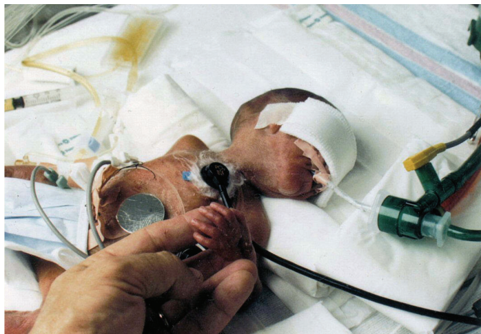
Figure 2. A premature baby with a gauze eyepatch to protect his eyes from the fluorescent light used to reduce high levels of bilirubin in his bloodstream which could cause jaundice and liver damage. The bilirubin therapy lamps deliver only three to five times the irradiation of the standard fluorescent ceiling lamps in typical intensive care nurseries, but the eyes of the babies are not protected from these despite the lack of any safety margin.

Moreover, the fluorescent ceiling lamps in the typical nursery are the same lamps which neonatologists use in slightly increased strength for the treatment of a preemie's excess bilirubin. In that application as "bilirubin lights", those same fluorescent lamps require mandatory eye patching for the babies beneath them because their radiation would otherwise quickly destroy those babies' retinas even in brief exposures (Fig. 2).