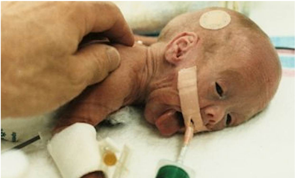
Premature Baby on Ventilator.jpg

That SUPPORT experiment was conducted from 2005 to 2009 in 23 U.S. hospitals to restrict the oxygen breathing help for half of the 1316 enrolled premature babies, in the hope that this already often tried dangerous intervention might reduce their risk of eye damage from baby-blinding retinopathy of prematurity (ROP) 17 . Instead of using the entire commonly administered “standard of care” range of blood oxygen levels from 85 to 95 percent, the researchers tried to find the elusive but imaginary exact level that would avoid the blinding without killing many babies, an even theoretically impossible task because it does not account for the human variability among the subjects of their research and their individual conditions. Despite the known high risks of increasing the expected lethal damage from asphyxiation to maybe prevent the non-lethal condition of eye damage, and without establishing a control group to which to compare their results (a standard for competent trial design), they split the enrolled babies into two groups which were to receive 85 to 89 percent in the low-oxygen group and 91 to 95 percent for the high-oxygen recipients 18 .