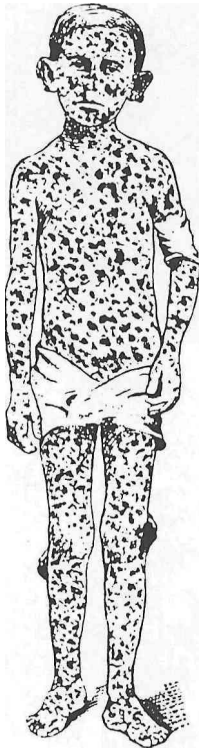
ECZEMA FROM VACCINATION