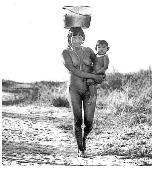
man be to man." (pp. 247-248)

"Women are the carriers of the true spirit of humanity ~ the love of the mother for her child. The preservation of that kind of love is the true function of women. And let me, at this point, endeavor to make it quite clear why I mean the love of a mother for her child and not the love of an equal for an equal or any other kind of love." (p.248).