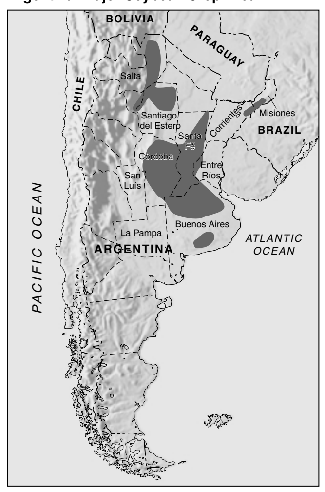
FIGURE 2 Argentina: Major Soybean Crop Area

In Brazil, the 1970 soy crop, from which exports were going to Japan, was only 1.509 million metric tons; but by 1980, it had grown to 15.156 million metric tons; 19.898 million in 1990; and today, 52.6 million. The area cultivated