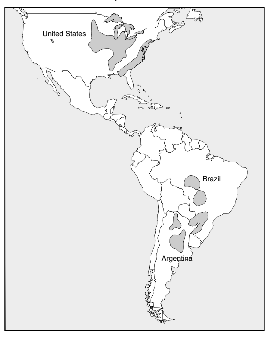
Western Hemisphere Soybean Crop Area: 80% World Production, 90% World Exports