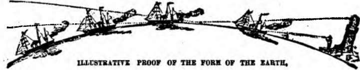
ILLUSTRATIVE PROOF OF THE FORM OF THE EARTH.

If white paper could blush, it would surely turn pink, When it read what is put o'er its face in black ink For the purpose of teaching poor children to think!