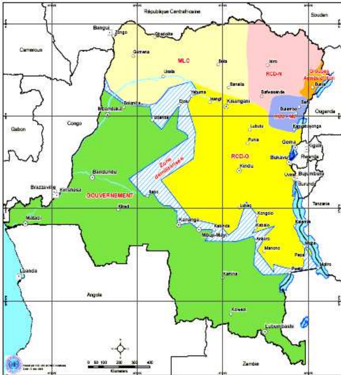
Zones Gouvernementales et Rebelles en Juin 2002

Katanga and the intensification of the war between the different militias in Ituri, the participants in the Inter-Congolese Dialogue ratified the Global and All-Inclusive Agreement in Sun City (South Africa) on 1 April 2003 along with an additional memorandum on the integration of the various armed groups into a single national army. The transition institutions were officially put in place on 30 June 2003.