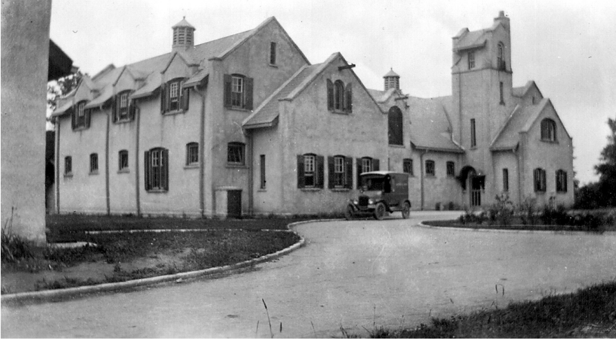
Figure 13.1 Connaught Laboratories' first smallpox vaccine production facility was located in several isolated rooms at the south-east corner of this building (the front corner at the left end of the image). Main laboratory building, c. 1917-18, Connaught Antitoxin Laboratories, Farm Section, University of Toronto.