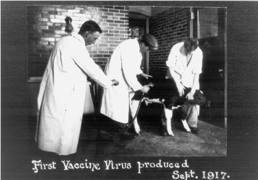
Figure 13.2 After packaging bulk smallpox vaccine imported from the New York City Health Department Laboratories for about a year, Connaught Laboratories began to fully prepare its own smallpox vaccine in September 1917. The first step in the production process was shaving and preparing the calf for inoculation.