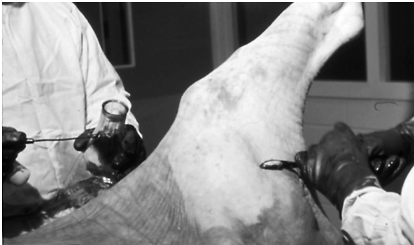
Figure 13.5 Harvesting Vaccinia pulp from calf, Smallpox Vaccine production, 1970s, Connaught Medical Research Laboratories.

Confident in his methods to produce a superior dried vaccine, Fenje faced growing pressure to expand production, particularly as the WHO worked towards intensifying its smallpox eradication program. In January 1964, Fenje was asked whether or not Connaught was prepared to supply 5 million doses of dried vaccine, should the WHO ask for it. The limiting factors he faced were the present production facilities, and an available support staff of only two or three. Calves could be processed weekly and about 44 calves would be needed to prepare the 15,380 grams of pulp required to make 5 million doses of vaccine. 54