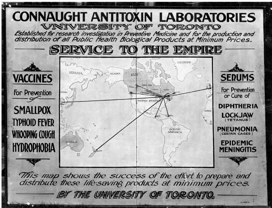
Figure 13.3 During the last years of World War I and expanding into the 1920s, Connaught Laboratories supplied smallpox vaccine, among other vaccines and antitoxins, to all provinces in Canada, as well as to other parts of the British Empire. This promotional map, dating from about 1920–21, was displayed at such public events as the Canadian National Exhibition and highlighted Connaught’s mission: ‘Established for research investigation in Preventive Medicine and for the production and distribution of all Public Health Biological Products at Minimum Prices’.

This level of smallpox vaccine production provided a valuable opportunity for Connaught scientists not only to build up practical experience with vaccine production, but also to study the effectiveness of the vaccine, investigate complications, and to focus on improving its quality. In particular, occasional complaints of vaccine failures from doctors, particularly during the Ontario smallpox epidemic in 1919–20, underscored the importance of how the vaccine was being shipped, stored and administered, and especially how heat could easily destroy its potency. Such complaints also highlighted the limited understanding of vaccination and vaccines among some physicians during this period and the importance of Connaught keeping detailed production records so that individual