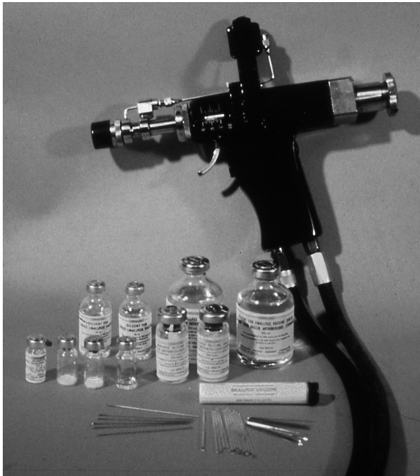
Figure 13.6 Jet injector and smallpox vaccine (dried) vials and needles, Connaught Medical Research Laboratories, 1970s.

Meanwhile, a certain level of political and administrative chaos in Canada continued to complicate the WHO's use of Connaught's vaccine. However, some unexpected and somewhat embarrassing press attention in May 1970, featuring 'an eloquent presentation' by Henderson on television of the need for smallpox eradication and for the need for vaccine, 77 finally prompted the Canadian government to donate 7 million doses of Connaught's vaccine to the WHO. 78 According to Henderson and Wilson,